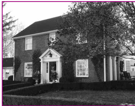
4101 Clausen Ave., Preservation Award

This year's award winners received their plaques during the Member Event on Saturday, June 24th. The Preservation Award went to 4101 Clausen Avenue; the Compatible Addition Award went to 4016 Grand Avenue; and the Good Neighbor Award went to 4131 Johnson Avenue.