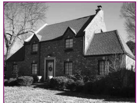
4131 Johnson Ave., Good Neighbor