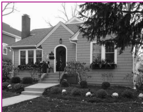
4016 Grand Ave., Compatible Addition